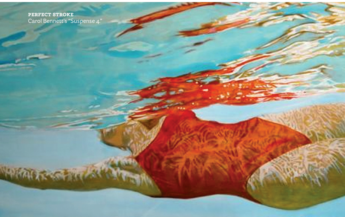
PERFECT STROKE Carol Bennett's "Suspense 4."