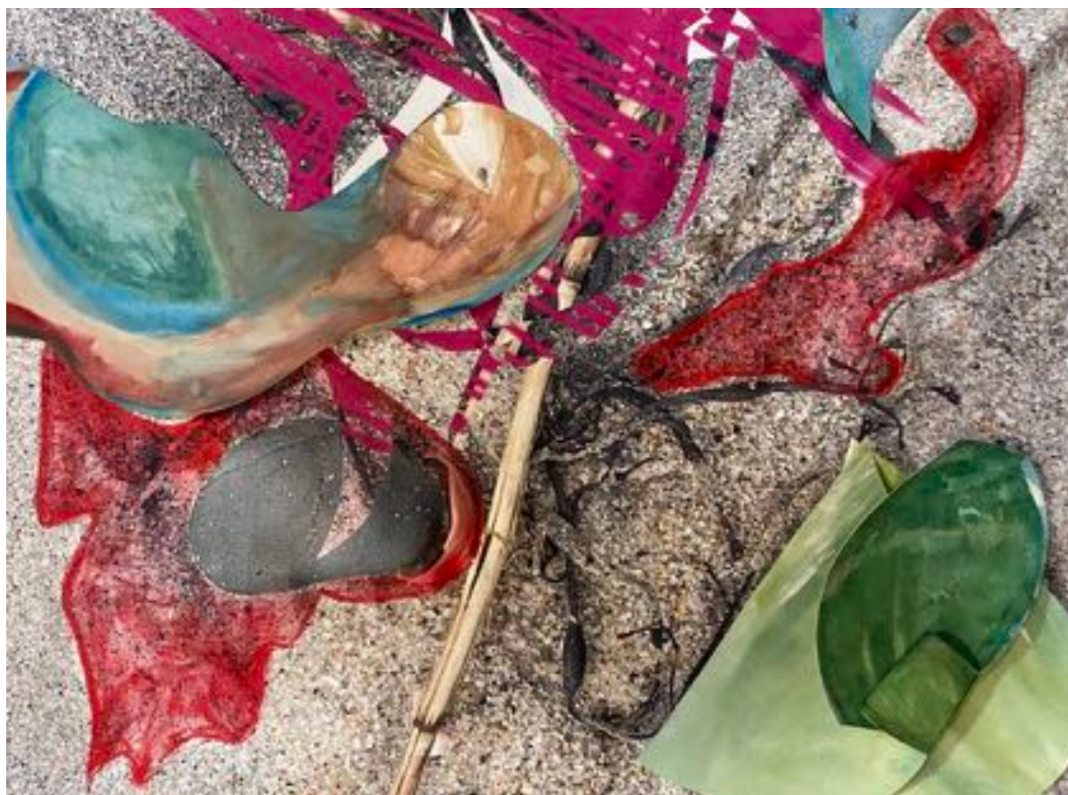
d'un moment à l'autre , 2022, Fabric paper ink watercolor, 36" x 36" by Marie-Claude Giroux

I've always seen music as the most powerful of the arts, its non physical and has an ability to transport me through time and space, Its open qualities and spiritual stimulation penetrate my soul/body/brain connection. When I work creatively with sound and use intentional mindfulness, I feel I am putting my ears and my heart in alignment with the heart of nature.